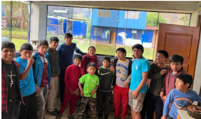
Life at Azul Wasi