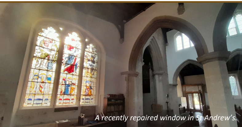
A recently repaired window in St Andrew's.

Find out more about the church, its worship and other activities, at www.chestertonmethodist.org.uk